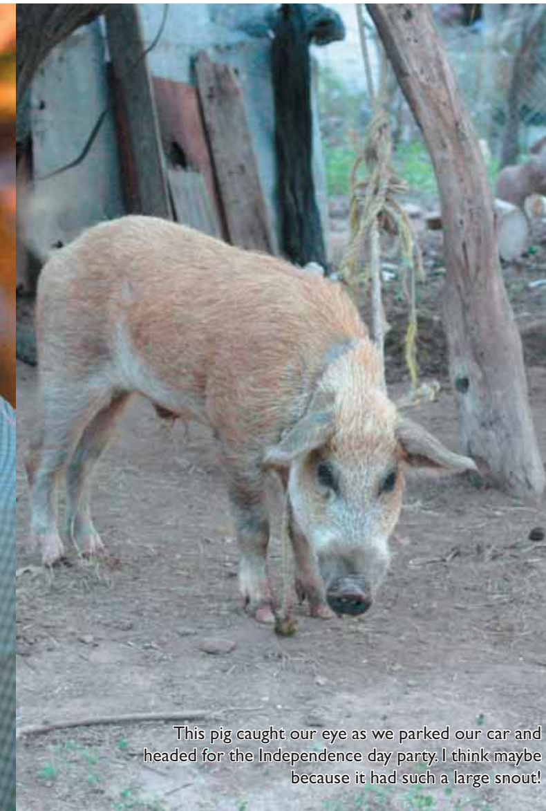
This pig caught our eye as we parked our car and headed for the Independence day party. I think maybe because it had such a large snout!