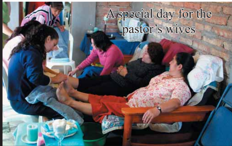
A special day for the pastor's wives

The booklet collator and poster printer are working. The collator will do 3000 booklets an hour. Then, we just run them through the stapler / folder and we have a booklet. What a time saver, and it is more accurate than doing it by hand. The poster printer will make 42" wide posters for a couple bucks a foot. This is a boon to pastors promoting events and campaigns. We do about three packets of campaign flyers and posters a week. A typical packet includes 1000 handbills and 100 11x17 posters all in two color on our Risograph. The cost is less than $4 and the Pastors are really happy with the service.- helping them promote their events.