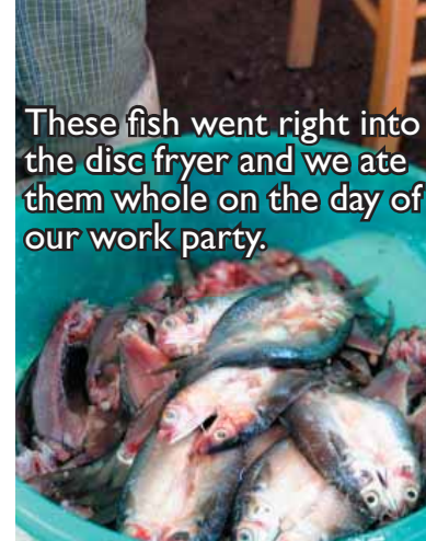
These fish went right into the disc fryer and we ate them whole on the day of our work party.