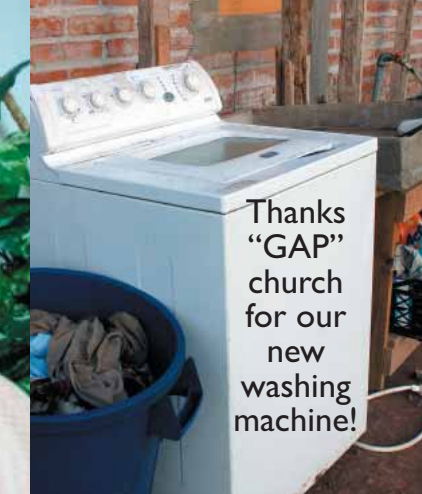
Thanks "GAP" church for our new washing machine!