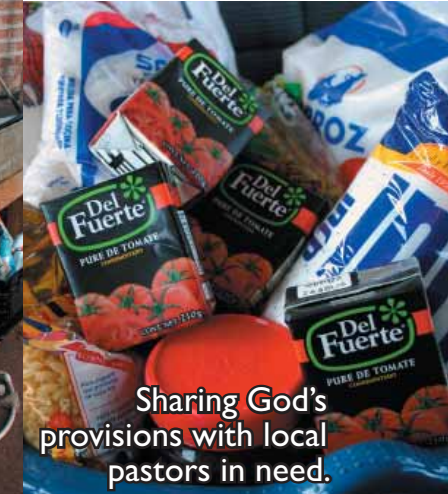
Sharing God's provisions with local pastors in need.