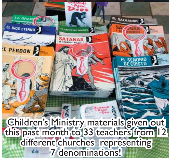
Children's Ministry materials given out this past month to 33 teachers from 12 different churches representing 7 denominations!