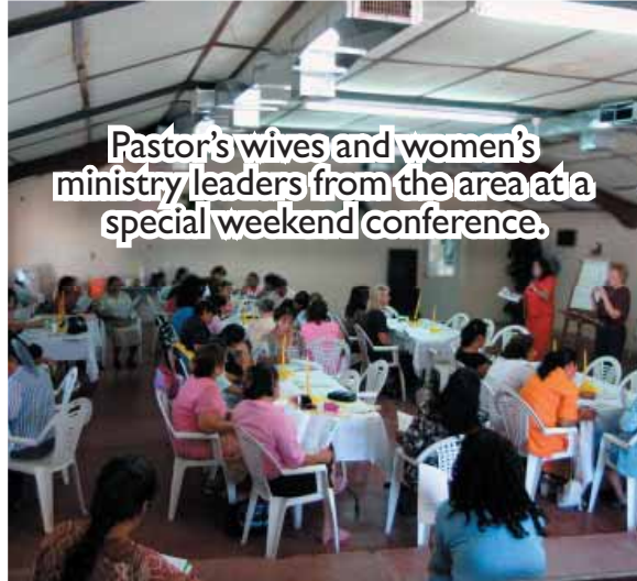
Pastor's wives and women's ministry leaders from the area at a special weekend conference.