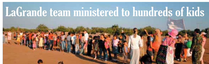
LaGrande team ministered to hundreds of kids