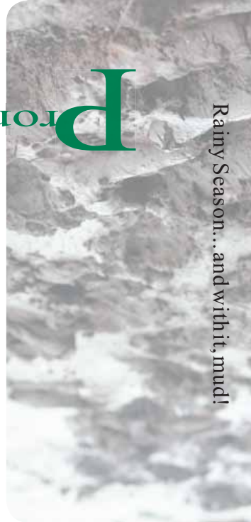
Rainy Season... and with it, mud!